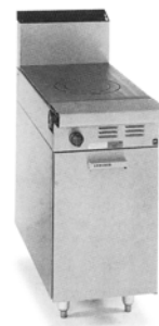
Master Series Model MST5S