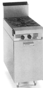
Master Series Model MST4S