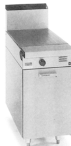
Master Series Model MST6S