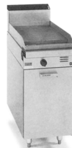
Master Series Model MST7S